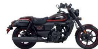
RENEGADE VEGAS 300