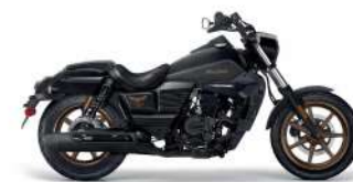
RENEGADE FREEDOM 300