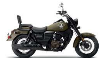
RENEGADE COMMANDO 300