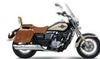
RENEGADE COMMANDO CLASSIC 300