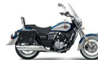
RENEGADE COMMANDO CLASSIC DELUXE 300